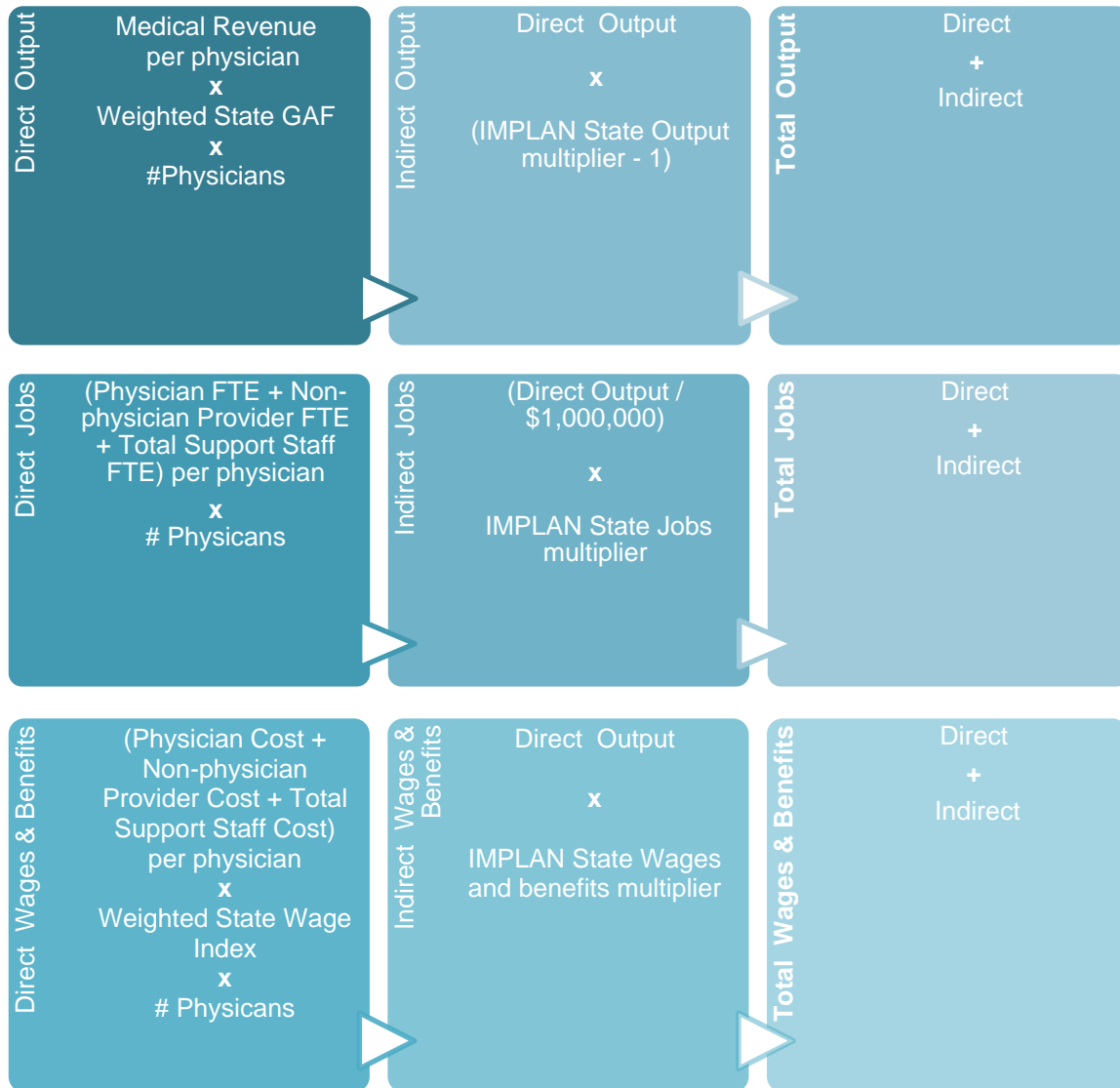
Figure 2. Overview of Methods