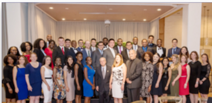
Award recipients were honored at the 2017 Excellence in Medicine Awards Ceremony