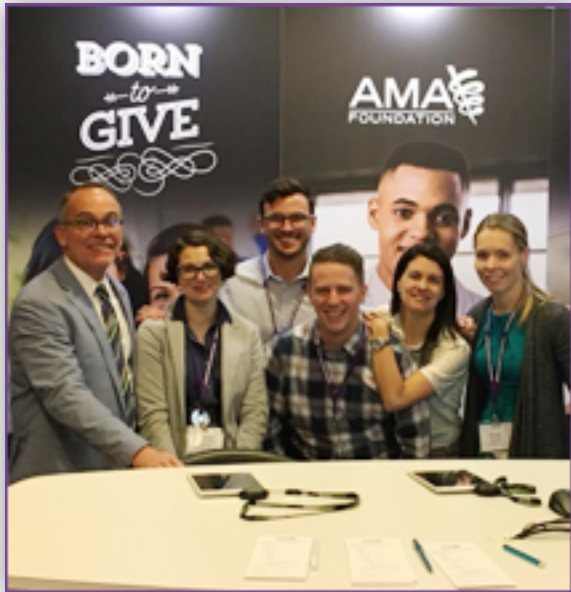
Members of the AMAF team read for a great meeting.

Each year, the Foundation takes advantage of the opportunity provided by the American Medical Association's House of Delegates meeting, which brings together thousands of physicians. It is the ideal setting to personally engage with many of our donors to update them on our programmatic impact and thank them for their support.