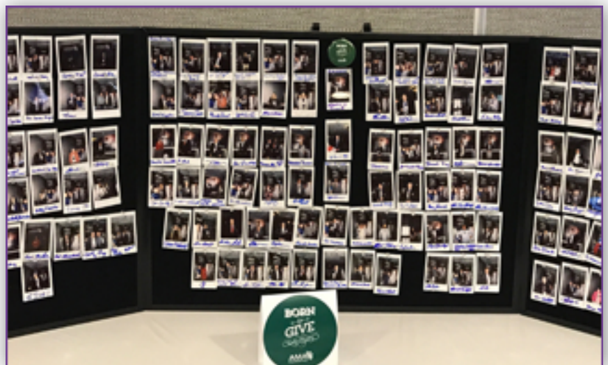
Celebrating all our amazing donors at the meeting.

We were humbled by this outpouring of generosity, which allowed us to exceed our fundraising goals and propel us into the year ahead.