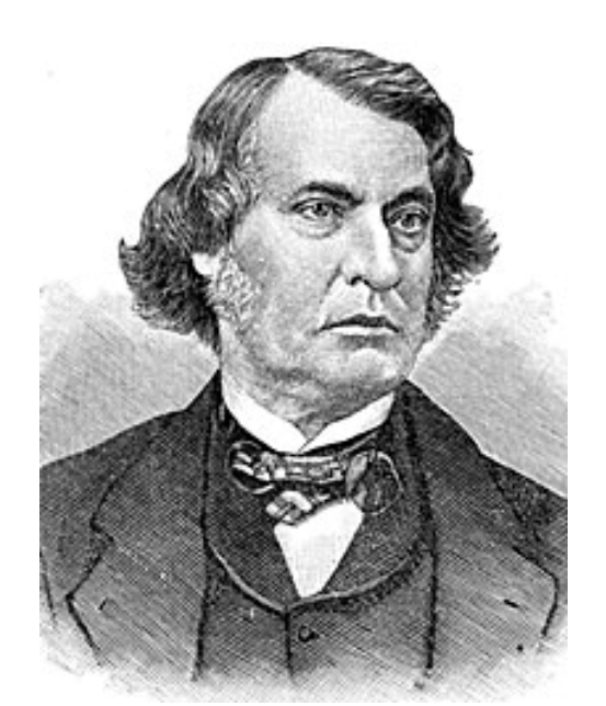
Senator Charles Sumner

"The original object, as declared in the charter and constitution of the [MSDC] Society, was the promotion of medical science, which nobody can doubt is worthy of congressional care. But when the [MSDC] Society is transmuted into a social club, it assumes a different character; and if this is done in derogation of the equal rights of all, it becomes a nuisance and a shame."