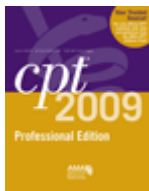
CPT® 2009 Professional Edition

Included in the CPT® Changes 2009 Workshops registration fee are the following complimentary products valued at more than $180.00: